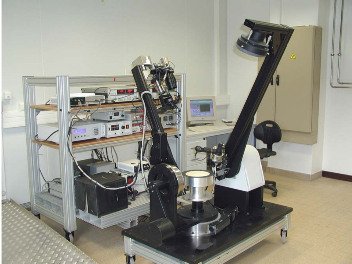
General view of the Spectro-gonio photometer at LPG